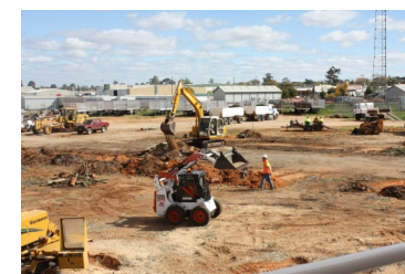
53 EIGHTH STREET UP-DATE: